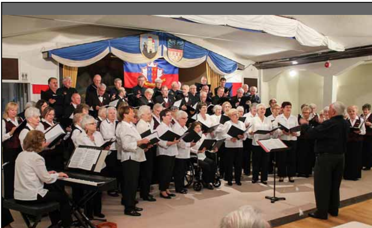
Choir Concert - 2018

Our Office Hours: Tuesday to Thursday - 09:00 to 13:00